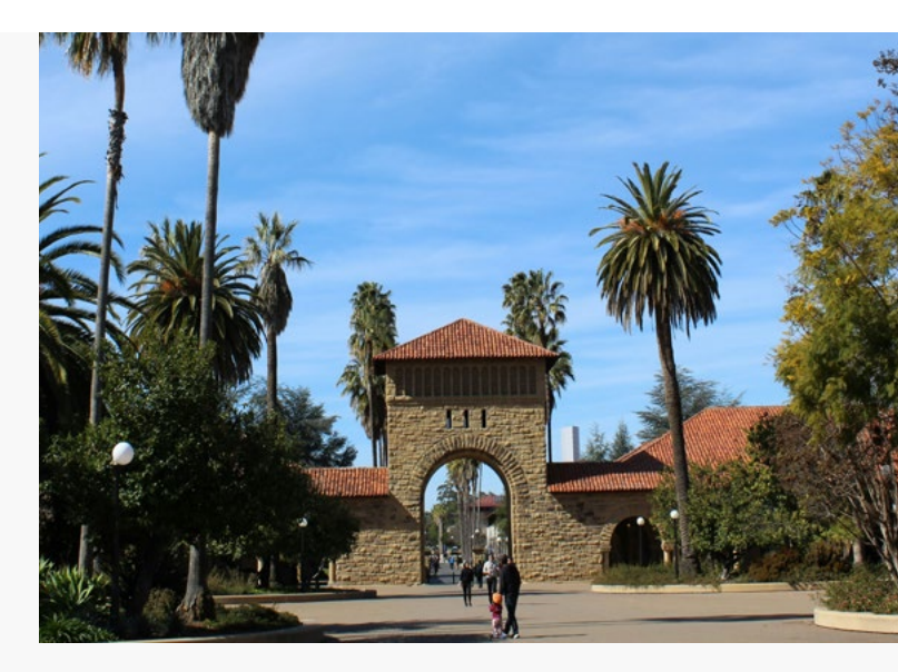
Striving to Thriving: Funder Collaboratives that Matter | 16

Through 2023, in addition to full group convenings and exploration of emerging issues, CAPSFC